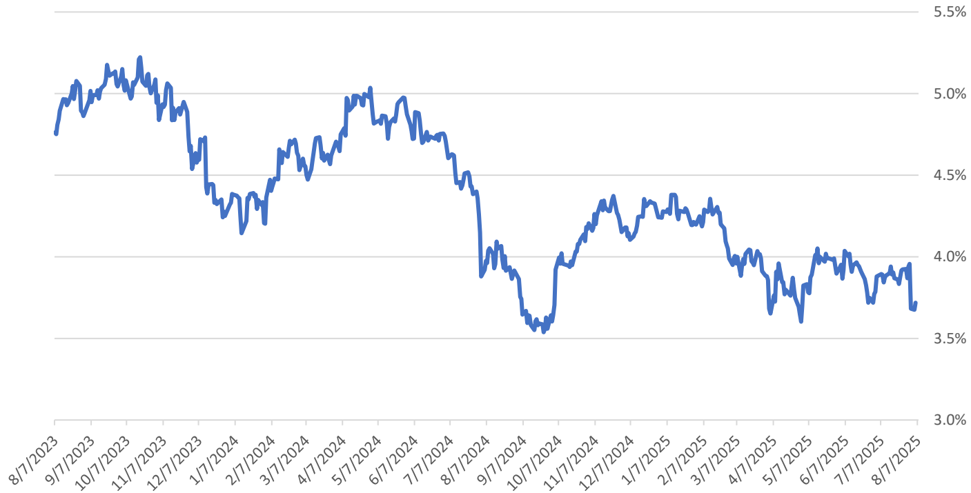
2-Year Treasury Yield

Sources: BTC Capital Management, Bloomberg