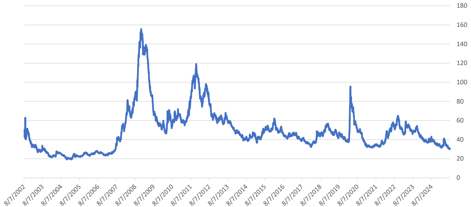
Global Aggregate Bond Index OAS

Sources: BTC Capital Management, Bloomberg